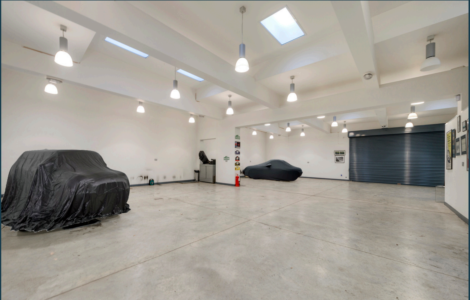
Supremely rare light industrial space with striking yet clean interior