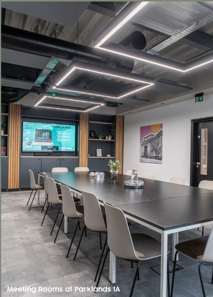
Meeting Rooms at Parklands 1A