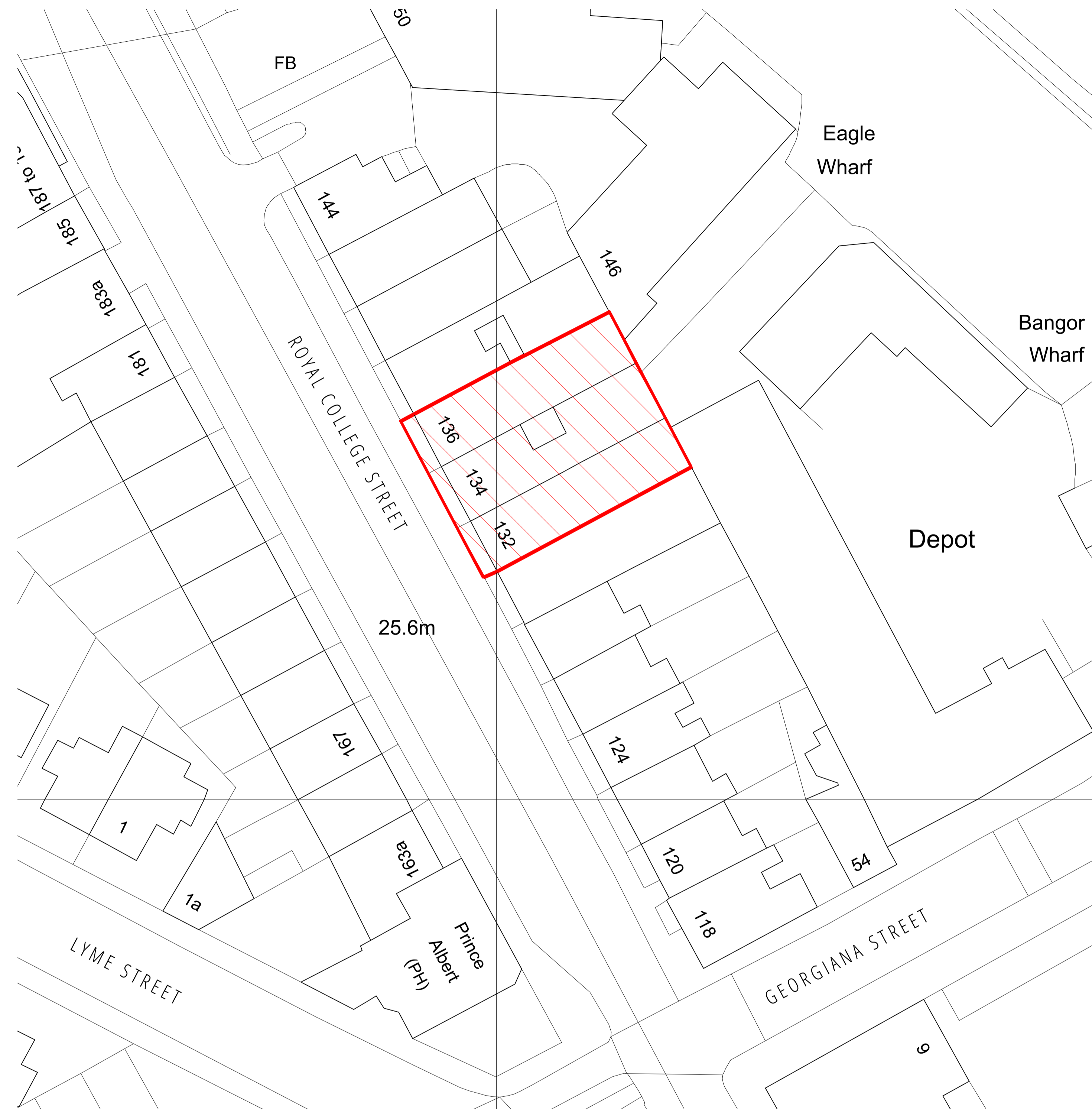
2 Site Block Plan 1:500

NOTES: 1. THIS DRAWING IS COPYRIGHT AND MUST NOT BE REPRODUCED IN WHOLE OR IN PART WITHOUT WRITTEN PERMISSION OF G&A DESIGN. 2. THIS DRAWING REPRESENTS DESIGN INTENT AND CONCEPT ONLY. HENCE IT CAN BE SCALED FOR PLANNING PURPOSES ONLY. 3. THIS DOCUMENT AND ALL ASSOCIATED DOCUMENTS ARE PREPARED FOR SPECIFIC SITE AND EVENT, AND INCORPORATE CALCULATIONS AND MEASUREMENTS AVAILABLE FROM THE CLIENT AT THE TIME OF DRAFTING. 4. THE RECIPIENT AGREES TO PROTECT THE CONTENTS FROM DISTRIBUTION AND DISSEMINATION EXCEPT AS REQUIRED FOR THE SPECIFIC EVENT NAMED, WITHOUT THE WRITTEN PERMISSION OF THE DESIGNER. 5. USE OF THIS DESIGN IS GRANTED TO THE CLIENT FOR THE SPECIFIC AND NAMED EVENT ONLY. COPYRIGHT © 2019