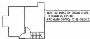
PROPOSED SECOND FLOOR PLAN SCALE 1:100