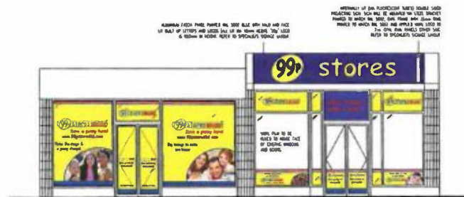
PROPOSED SHOP FRONT ELEVATION SCALE 1:50