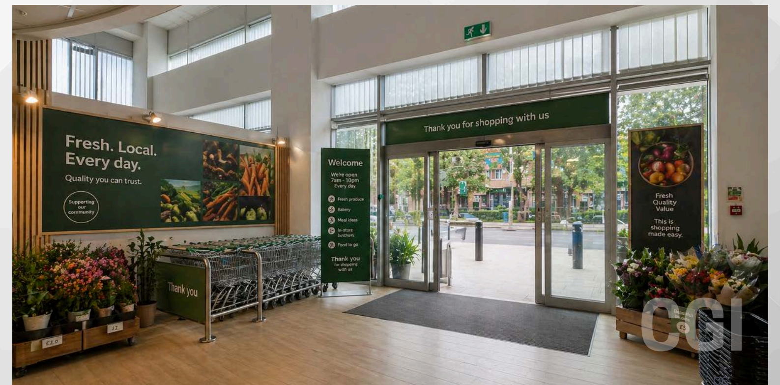
Images are CGI and for illustrative purposes only. Final results may vary.