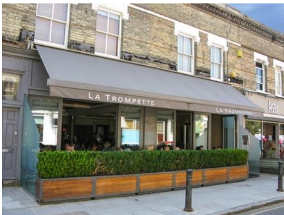
2 La Trompette