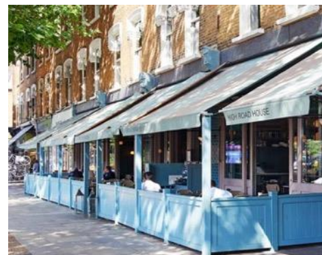
3 High Road House