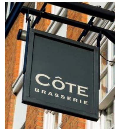
5 Cote Brasserie