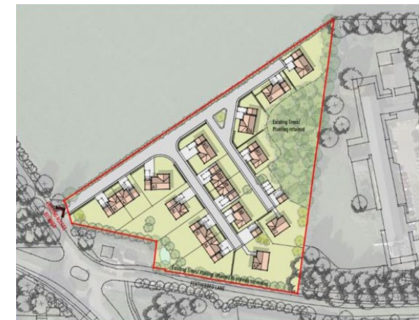
INDICATIVE SKETCH OF THE RESIDENTIAL PROPOSAL OF 16 HOUSES AT LOT 2

The Wealden District Council CIL Charging Schedule was adopted November 2015. Lot 1 and 2 lie within the CIL charging band of £150 per sqm (not indexed).