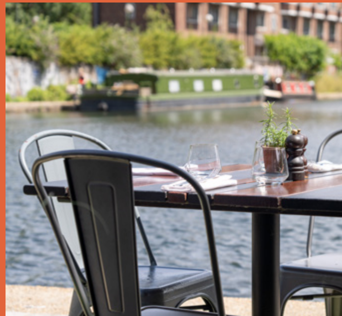
ONSITE RESTAURANT - ROTUNDA