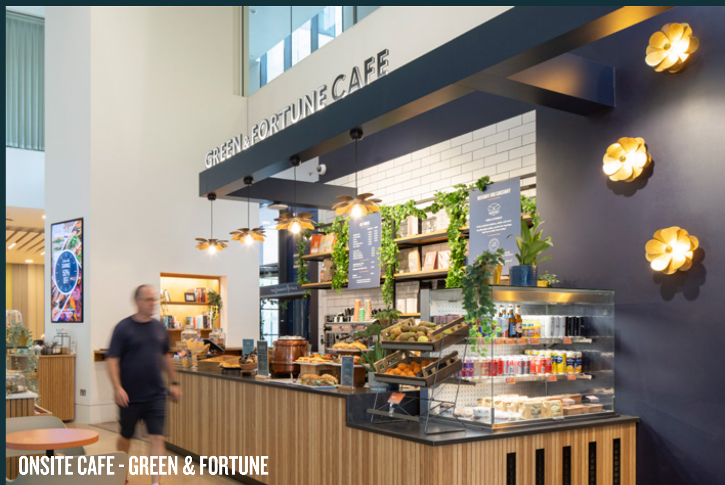
ONSITE CAFE - GREEN & FORTUNE