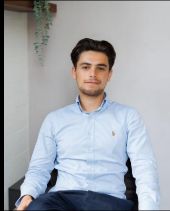
JACOB DOBRIN AGENCY jacob@belcor.london 07956 195 700