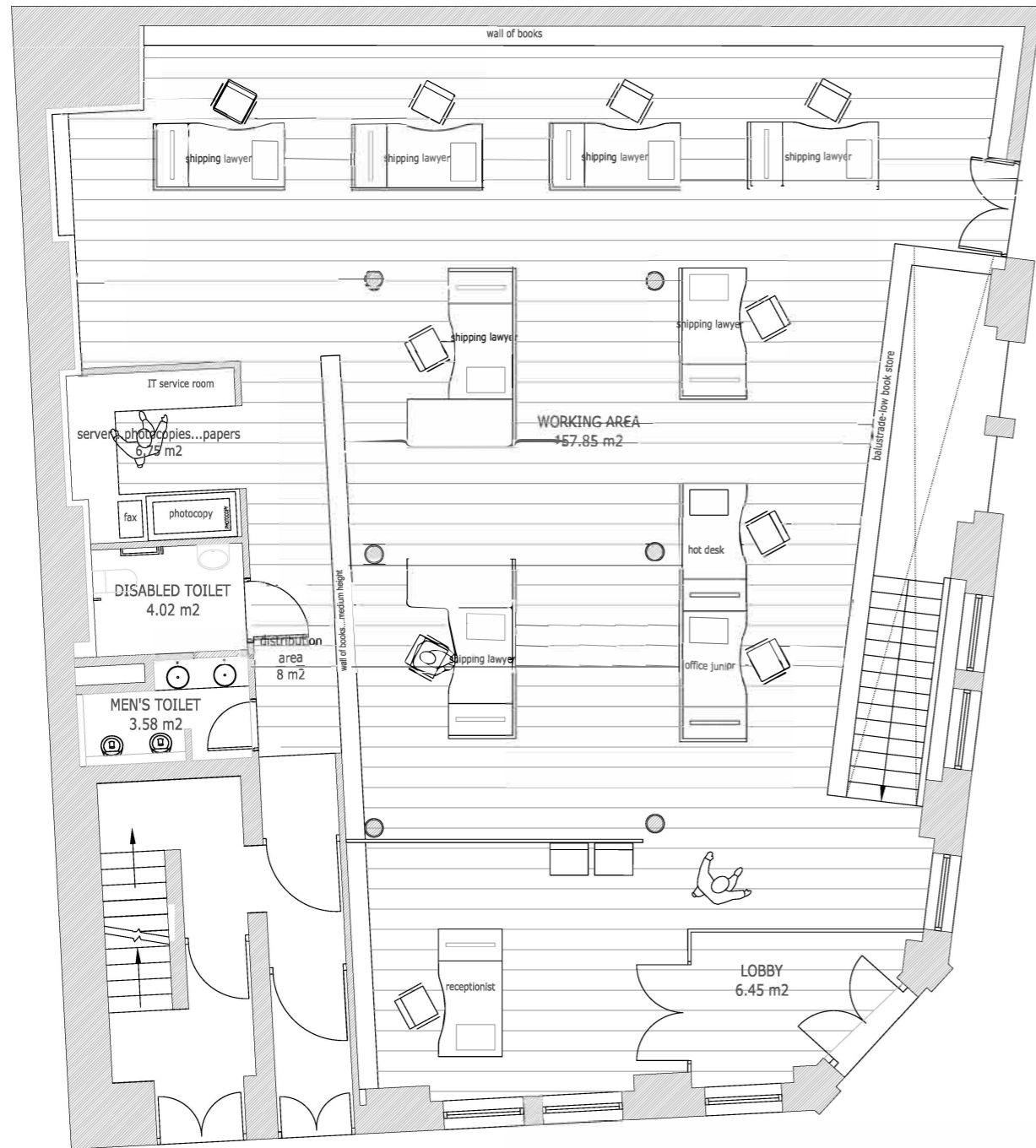
GROUND FLOOR PLAN 195.50 M2