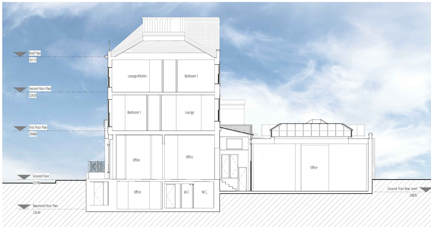
1 Existing Section BB' 1: 100

NOTES: 1. THIS DRAWING IS COPYRIGHT AND MUST NOT BE REPRODUCED IN WHOLE OR IN PART WITHOUT WRITTEN PERMISSION OF GAA DESIGN. 2. THIS DRAWING APPEARS DESIGN INTENT AND CONCEPT ONLY. HENCE IT CAN BE SCALED FOR PLANNING PURPOSES ONLY. 3. THIS DOCUMENT AND ALL ASSOCIATED DOCUMENTS ARE PREPARED FOR SPECIFIC SITE AND SCHEME AND INCORPORATE CALCULATIONS AND MEASUREMENTS AVAILABLE FROM THE CLIENT AT THE TIME OF DRAFTING. 4. THE RECIPIENT AGREES TO PROTECT THE CONTENTS FROM DISSEMINATION AND DISSEMINATION EXCEPT AS REQUIRED FOR THE SPECIFIC CLIENT NAMED, WITHOUT THE WRITTEN PERMISSION OF THE DESIGNER. 5. USE OF THIS DESIGN IS GRANTED TO THE CLIENT FOR THE SPECIFIC AND NAMED EVENT ONLY. COPYRIGHT © 2019