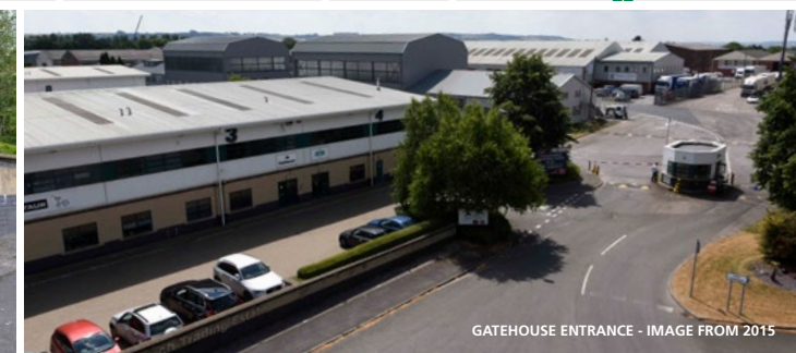
GATEHOUSE ENTRANCE - IMAGE FROM 2015