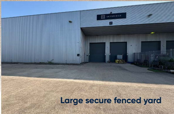
Large secure fenced yard