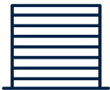
TWO LOADING DOORS