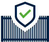
LARGE SECURE FENCED YARD