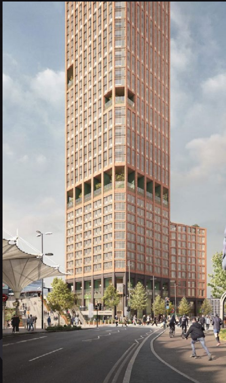
Meridian Steps, Stratford