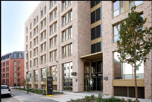
Morriss House, Nottingham