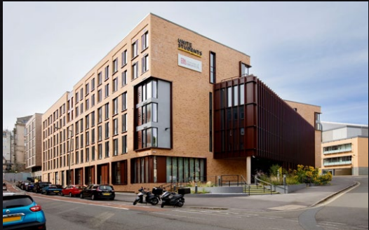
Campbell House, Bristol