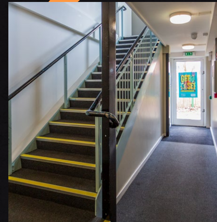
RAGLAN HOUSE • RAGLAN STREET • COVENTRY CV1 5QF