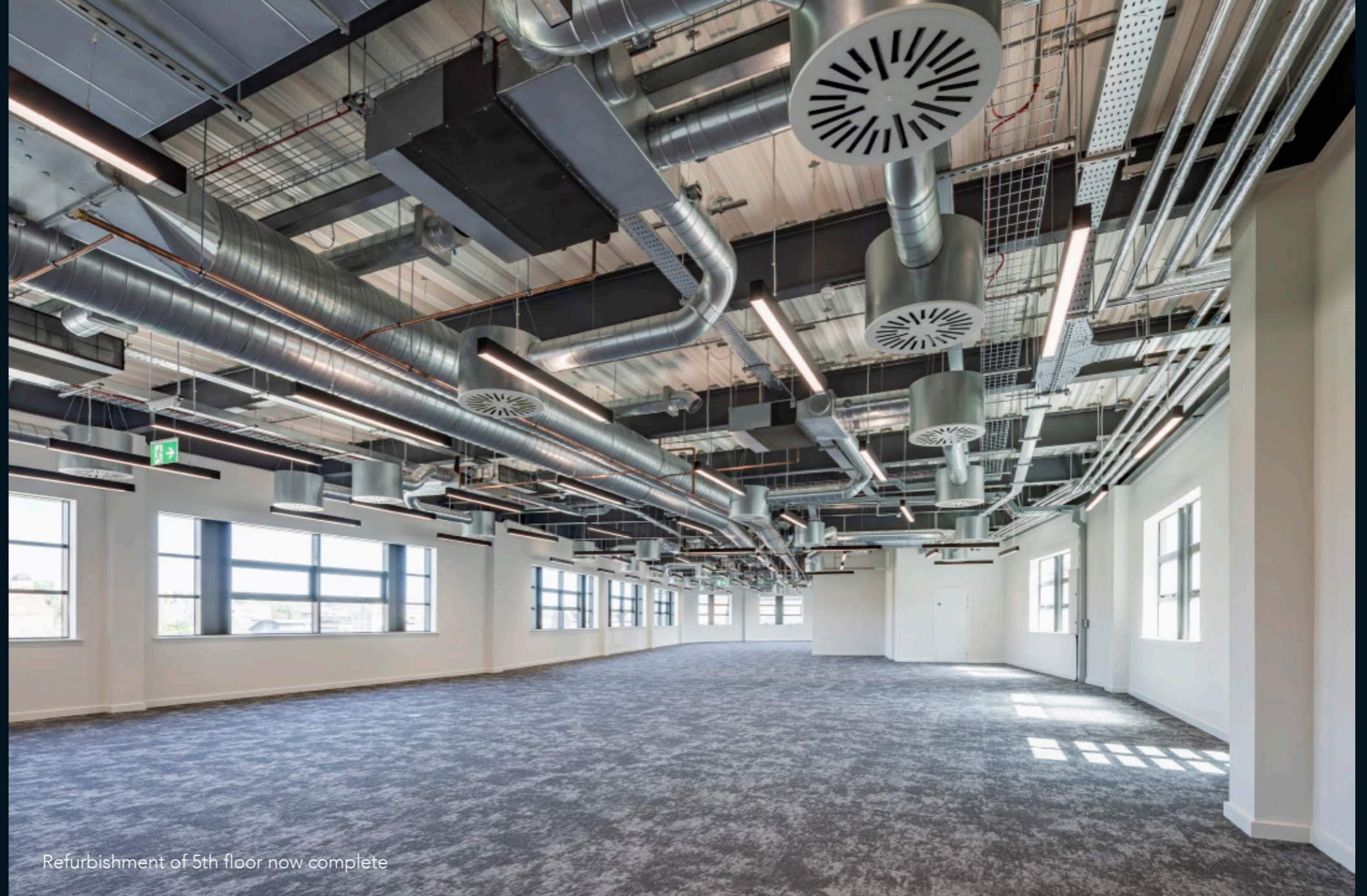
Refurbishment of 5th floor now complete

The added flexibility of the largest open floor plate in Newcastle, with the benefit of four access points from the core, provides an opportunity to meet a range of requirement sizes.