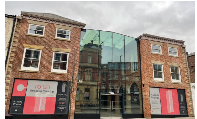
White Cloth Hall