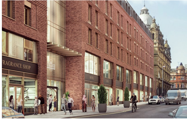
CGI Premier Inn - George St

A six-storey development is soon to transform the market's George Street side, featuring a 143-room hotel, a council-run gym, and new commercial units on the ground floor.