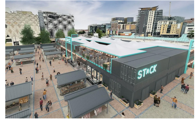
CGI Stack - Kirkgate Market