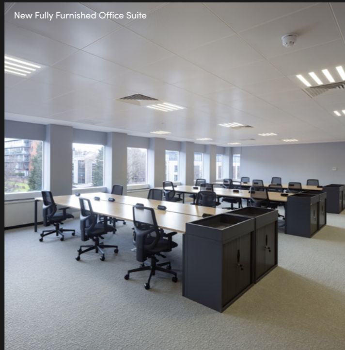
New Fully Furnished Office Suite