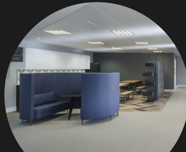
Full kitchen facility