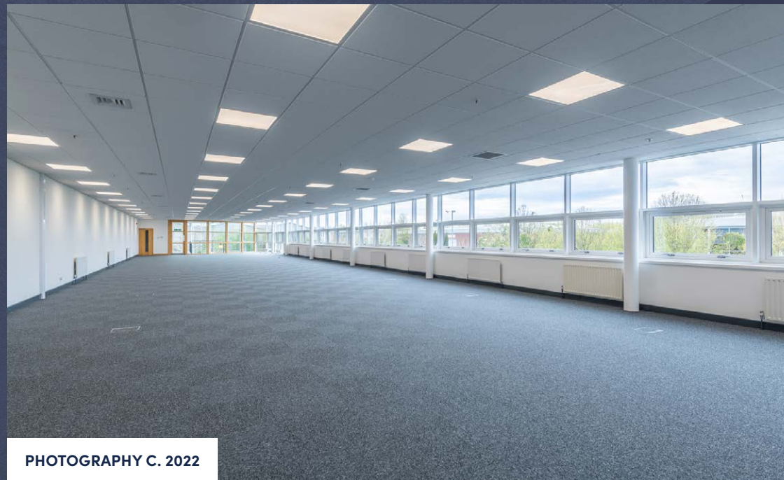
PHOTOGRAPHY C. 2022