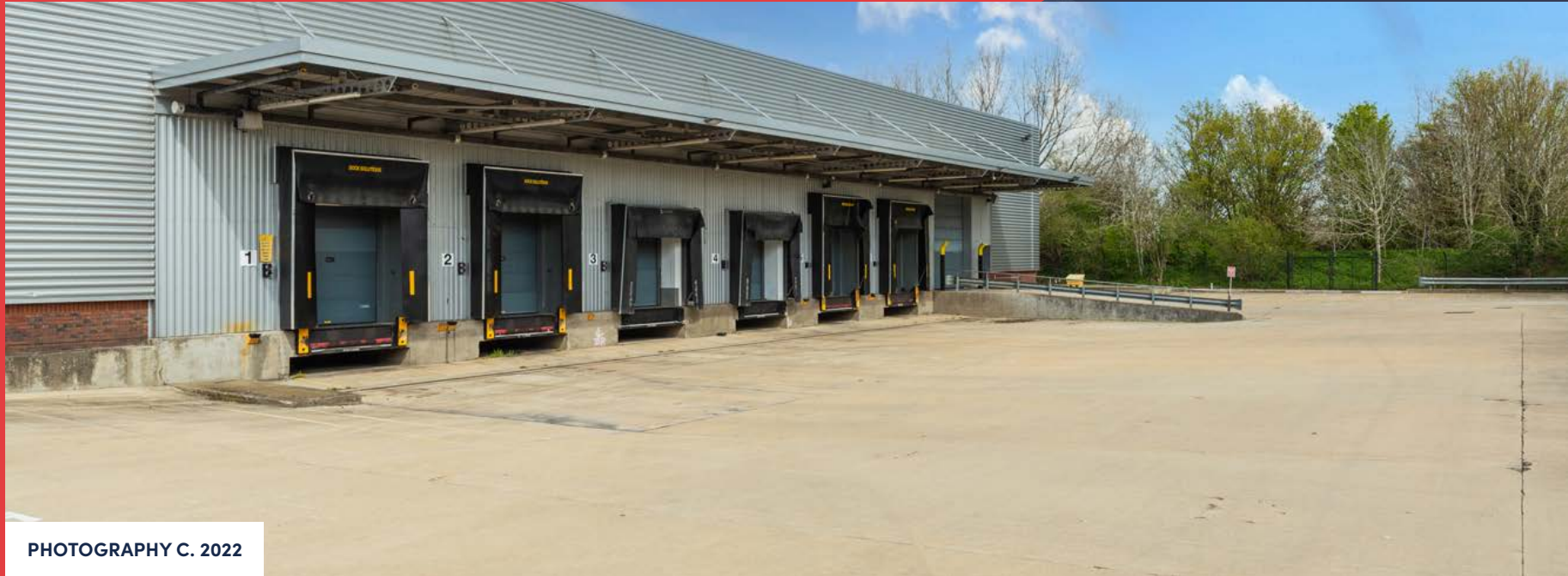
PHOTOGRAPHY C. 2022