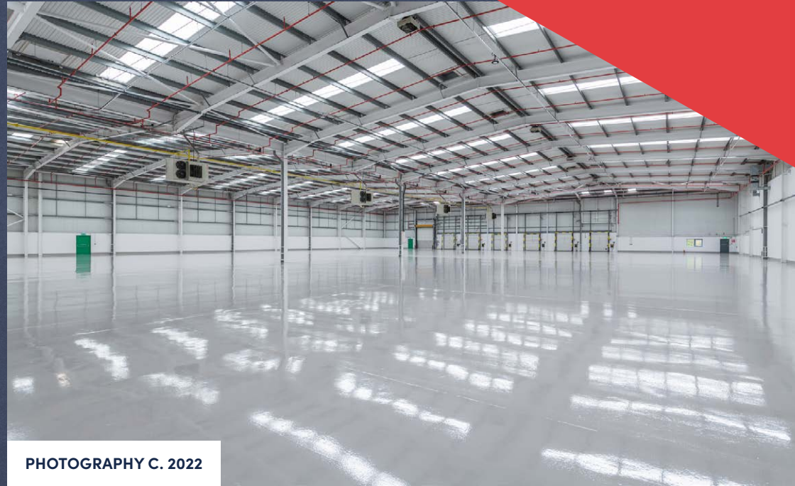
PHOTOGRAPHY C. 2022