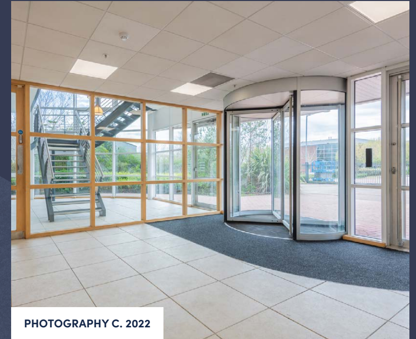
PHOTOGRAPHY C. 2022