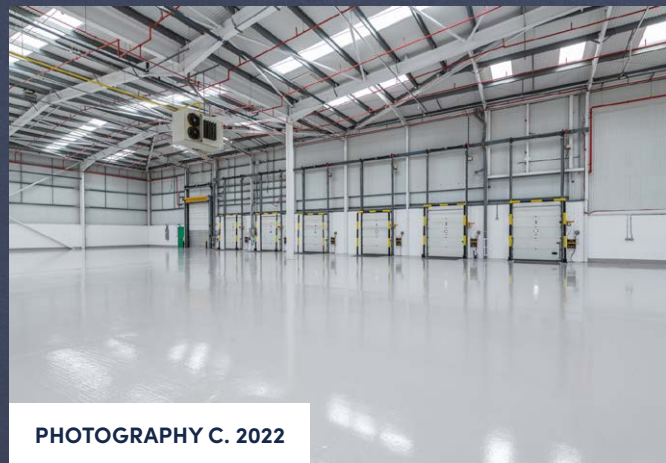
PHOTOGRAPHY C. 2022