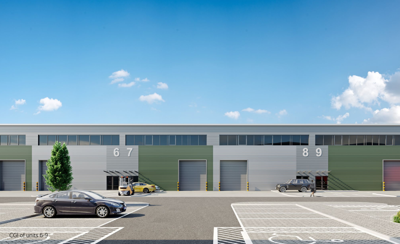
CGI of units 6-9