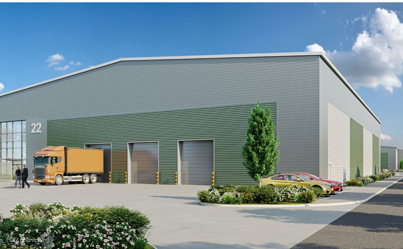
CGI of unit 22