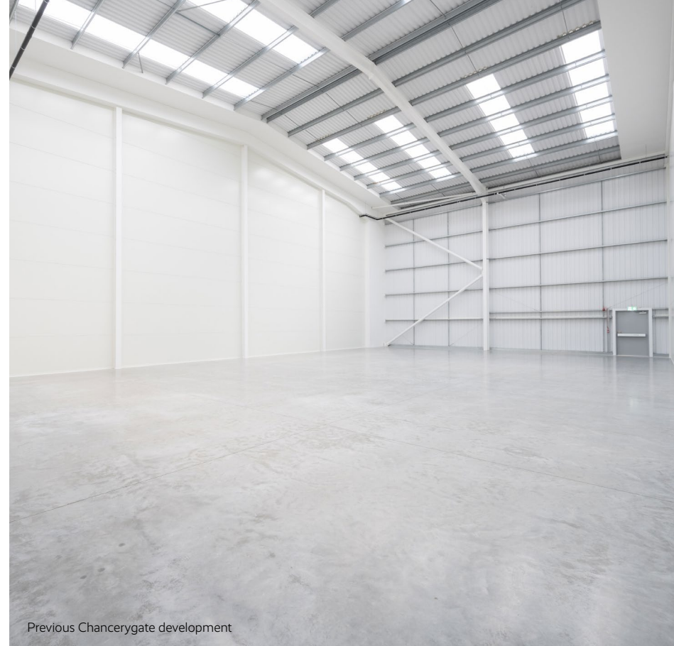
Previous Chancerygate development