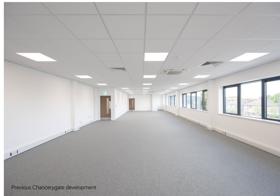
Previous Chancerygate development