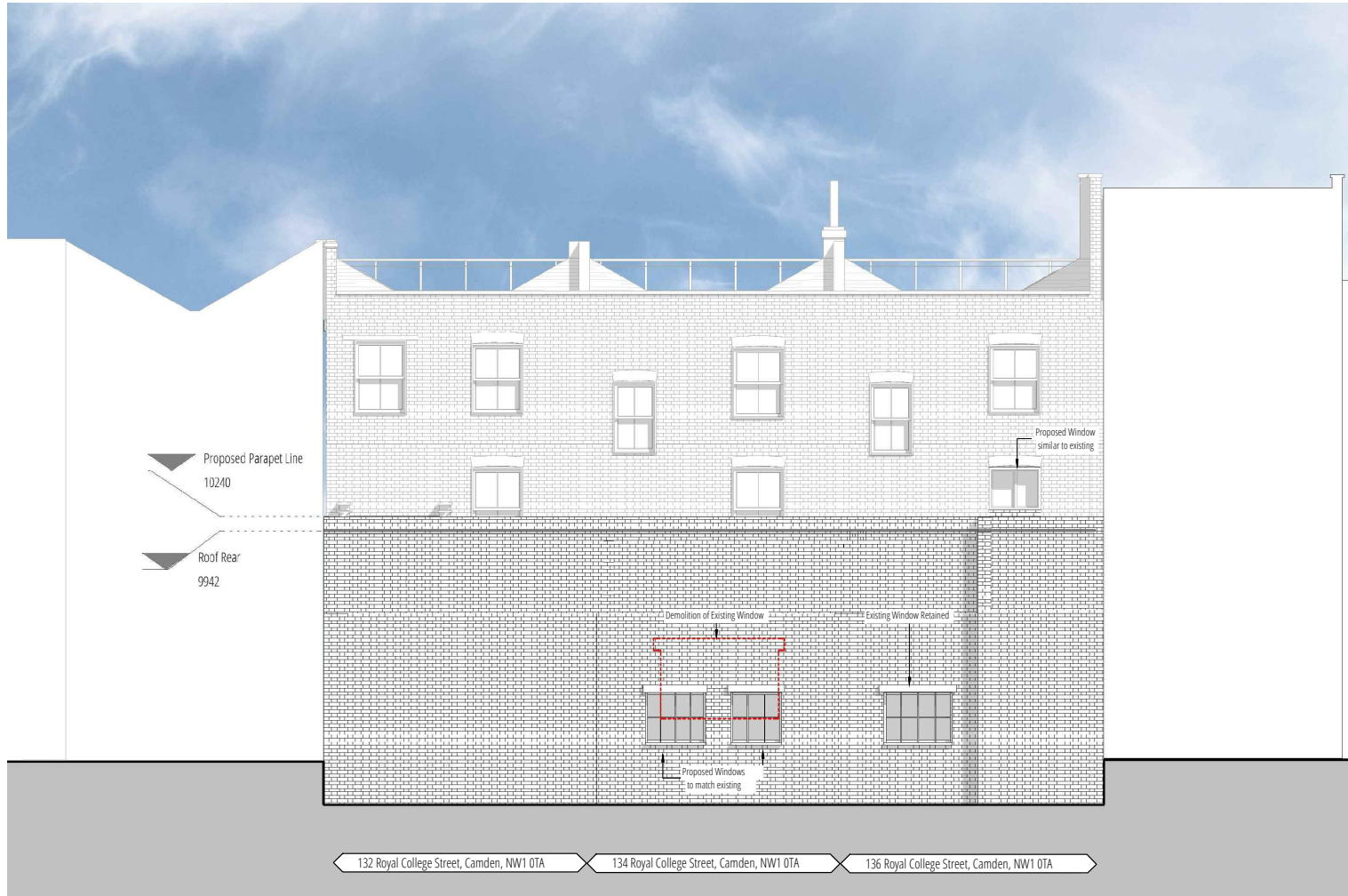
1 Proposed Rear Elevation 1:100

NOTES: 1. THIS DRAWING IS COPYRIGHT AND MUST NOT BE REPRODUCED IN WHOLE OR IN PART WITHOUT WRITTEN PERMISSION OF GAA DESIGN. 2. THIS DRAWING REPRESENTS DESIGN INTENT AND CONCEPT ONLY. HENCE IT CAN BE SCALED FOR PLANNING PURPOSES ONLY. 3. THIS DOCUMENT AND ALL ASSOCIATED DOCUMENTS ARE PREPARED FOR SPECIFIC SITE AND SCHEME, AND INCORPORATE CALCULATIONS AND REQUIREMENTS AVAILABLE FROM THE CLIENT AT THE TIME OF DRAWING. 4. THE RECEIPIENT AGREES TO PROTECT THE CONTENTS FROM DISSEMINATION AND DISSEMINATION EXCEPT AS REQUIRED FOR THE SPECIFIC CLIENT NAMED, WITHOUT THE WRITTEN PERMISSION OF THE DESIGNER. 5. USE OF THIS DESIGN IS GRANTED TO THE CLIENT FOR THE SPECIFIC AND NAMED EVENT ONLY. COPYRIGHT © 2019