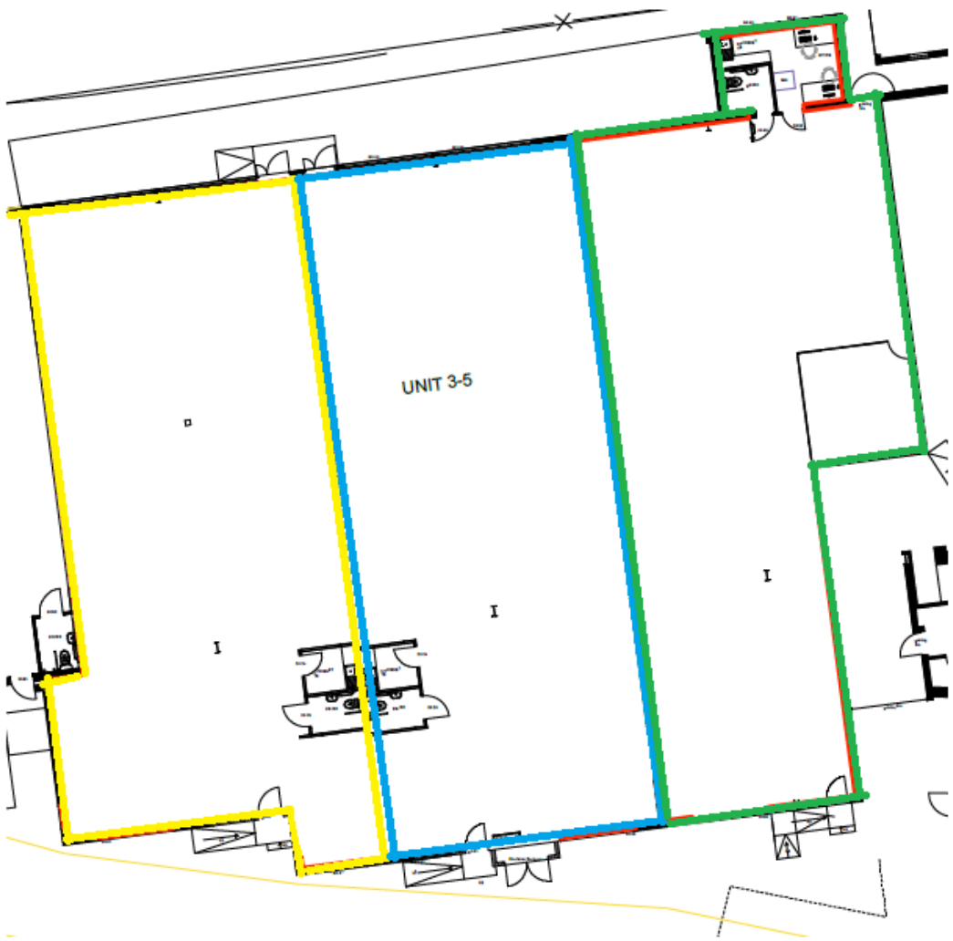
2 Ground Floor Plan Scale: 1:200