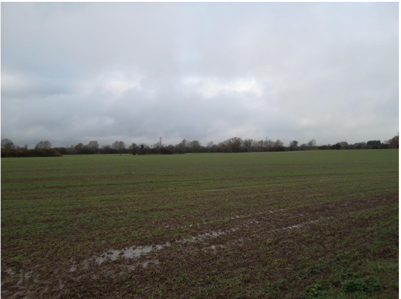
View from within the property looking north west