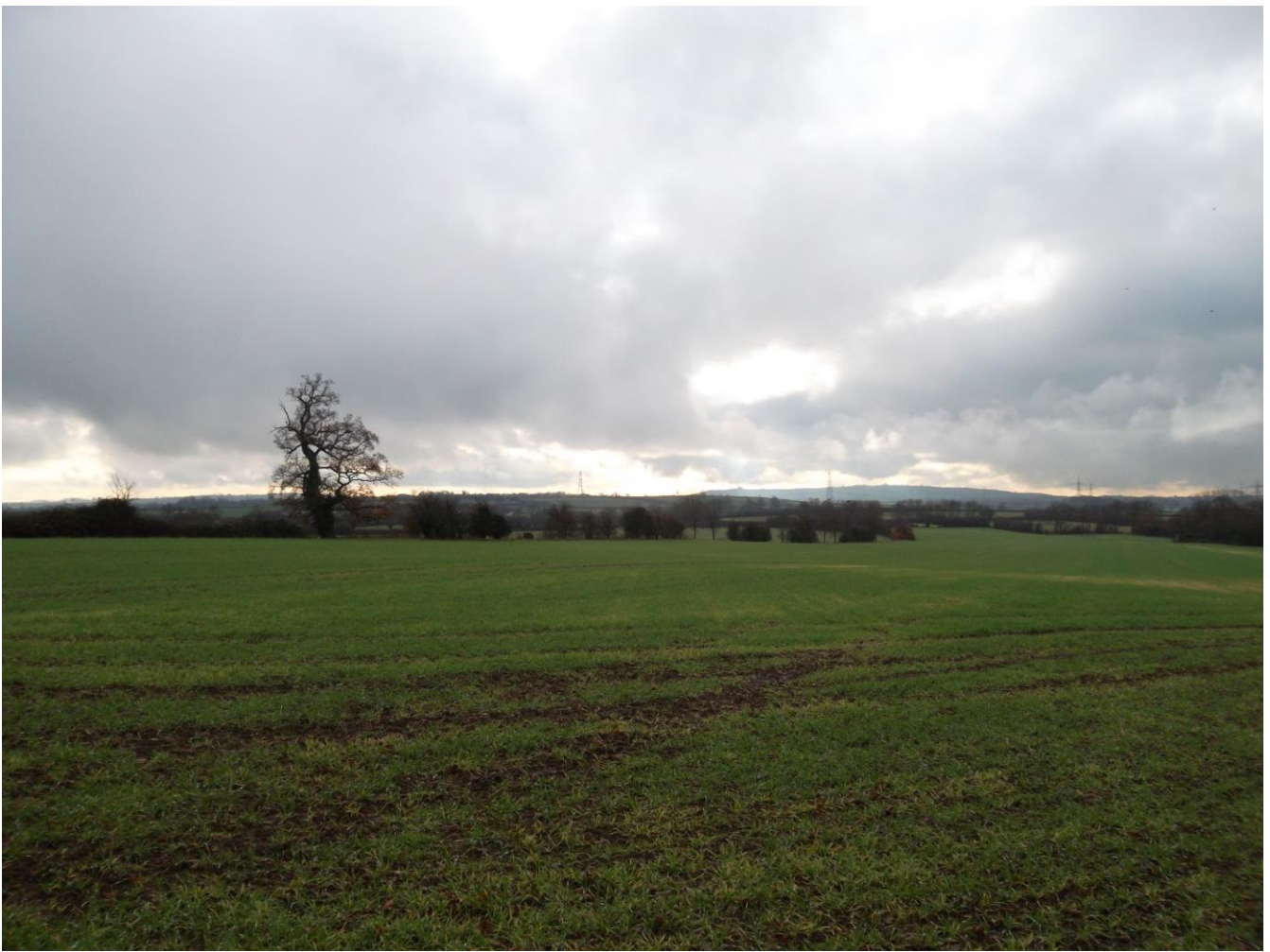
View from within the property looking south