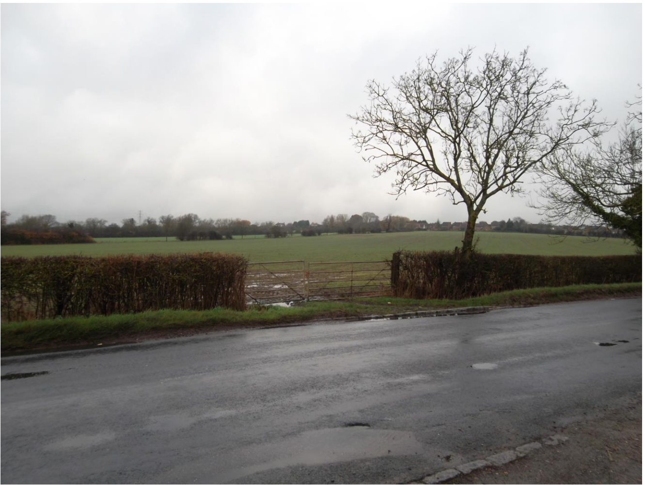
View of the property looking north from East Claydon Road