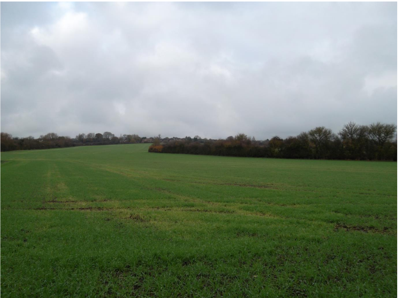
View from within the property looking north