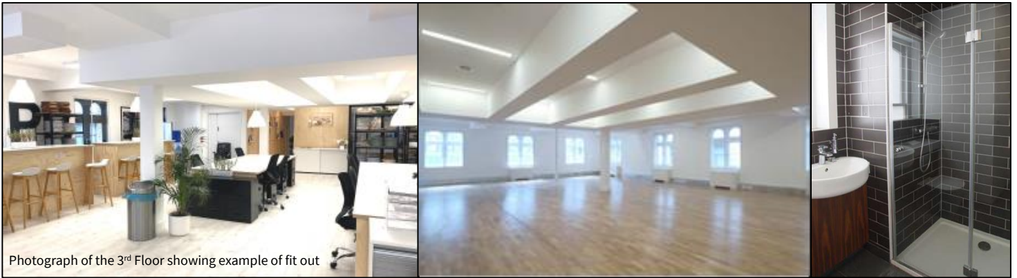
Photograph of the 3 rd Floor showing example of fit out