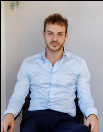
DANIEL JACKSON AGENCY dj@belcor.london 07725 203254