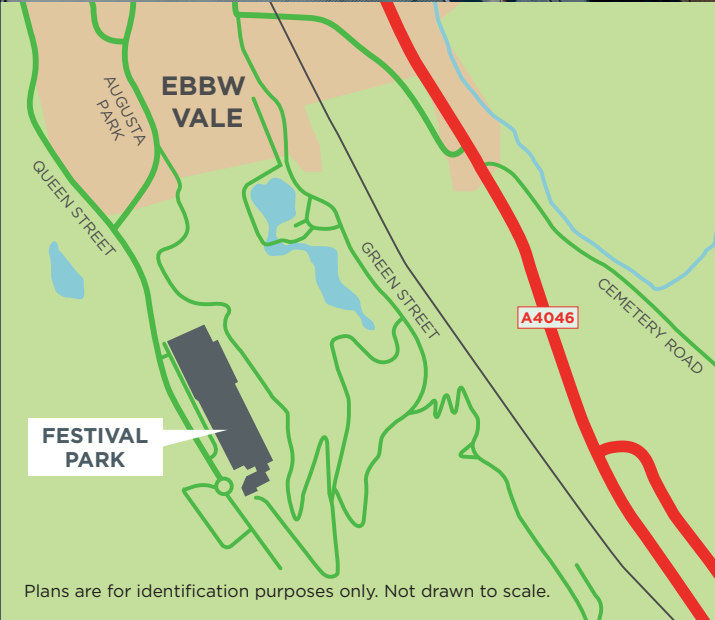
Plans are for identification purposes only. Not drawn to scale.