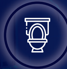
Male & Female WCs