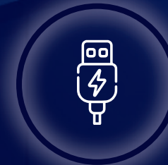
Plug and Play Ready