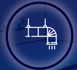
Exposed VRF Cooling