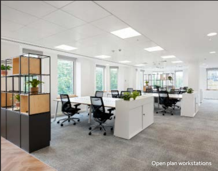
Open plan workstations