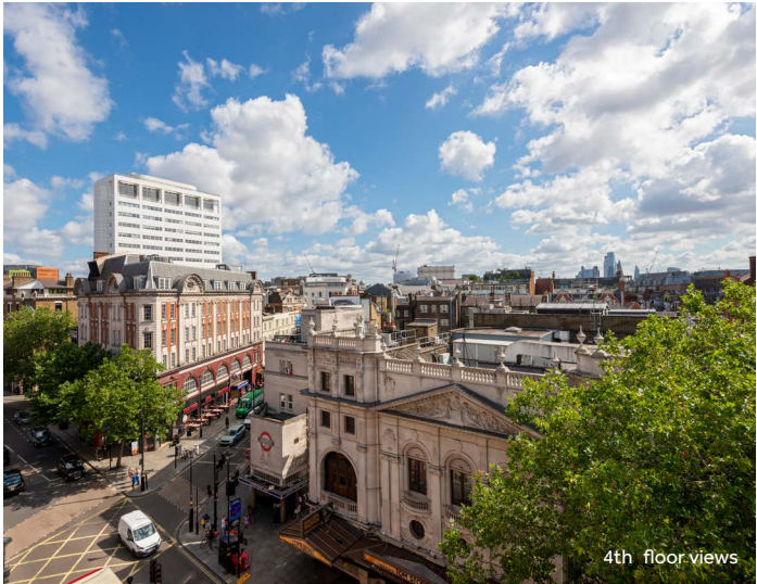
4th floor views