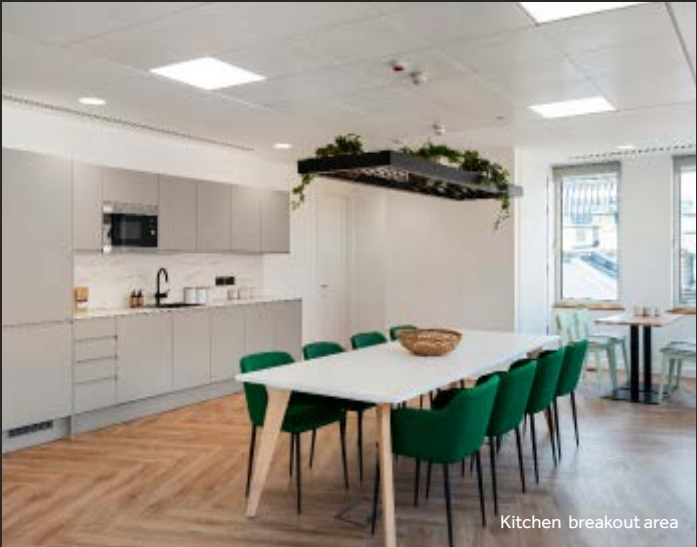
Kitchen breakout area