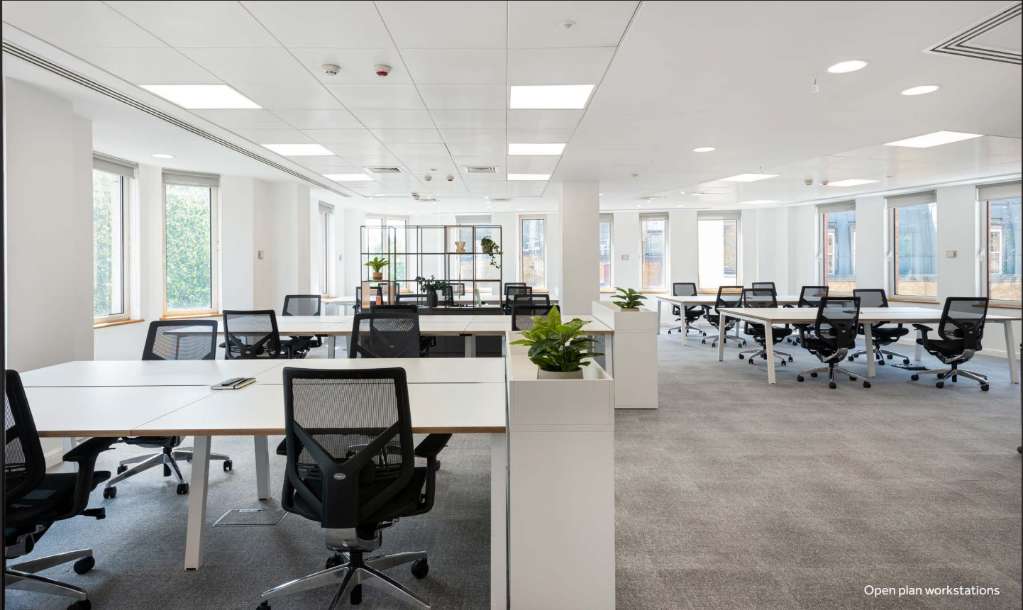
Open plan workstations