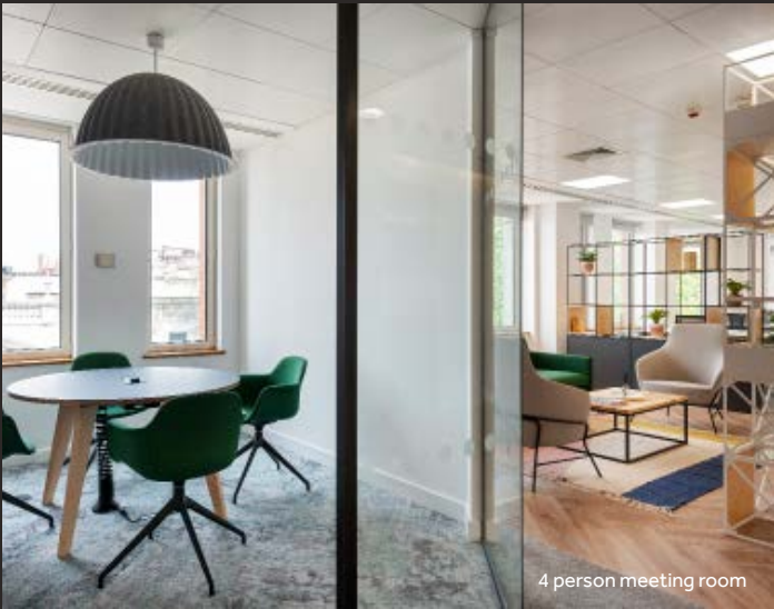
4 person meeting room