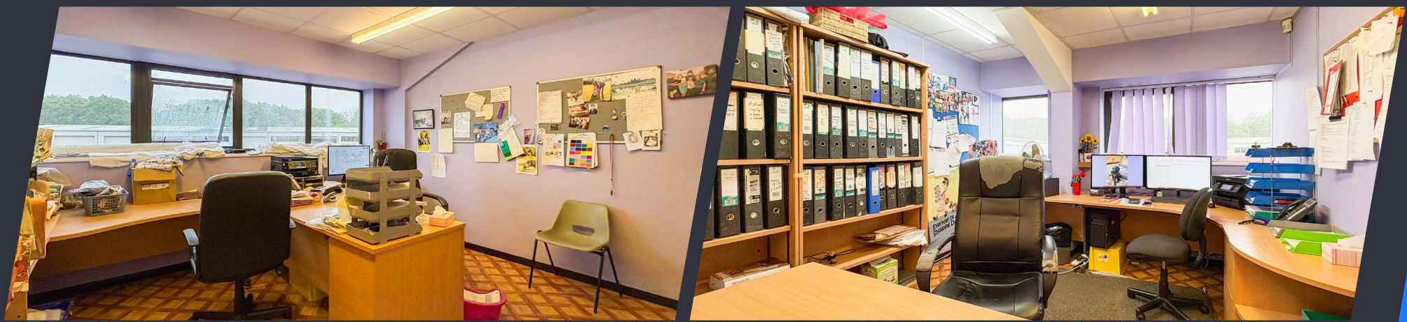
UNIT 3, KINGFISHER PARK, HEADLANDS BUSINESS PARK, RINGWOOD, HANTS BH24 3NX