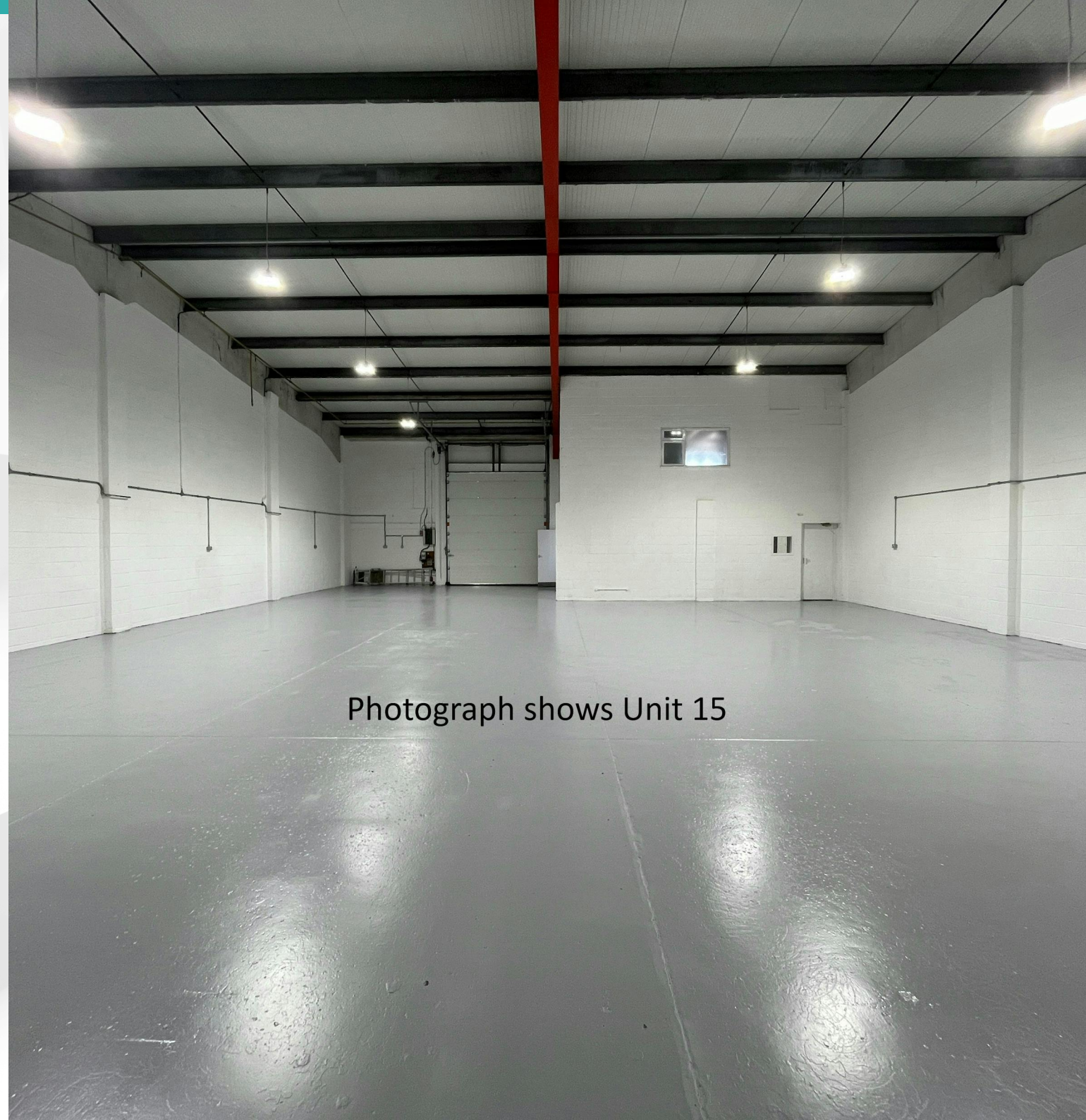
Photograph shows Unit 15