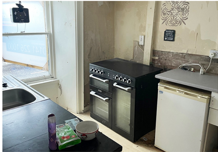
162 High Street Irvine KA21 8AN