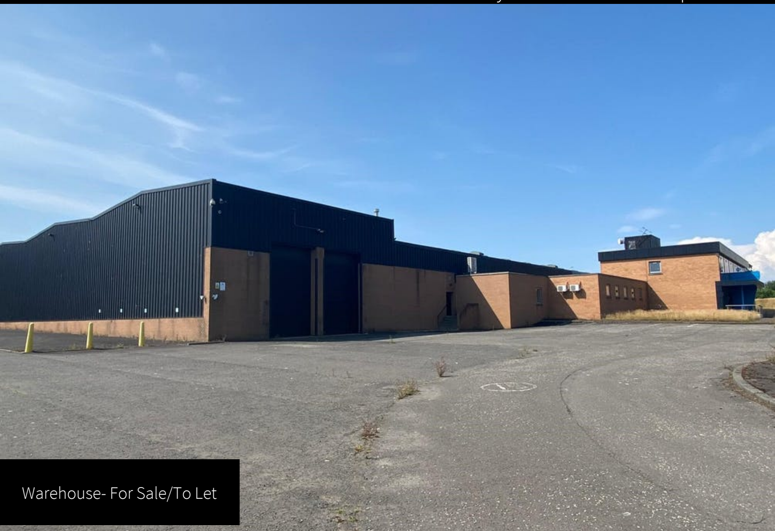
Warehouse- For Sale/To Let

69,705 sq.ft Industrial Warehouse with Secure Yard- For Sale/May Let