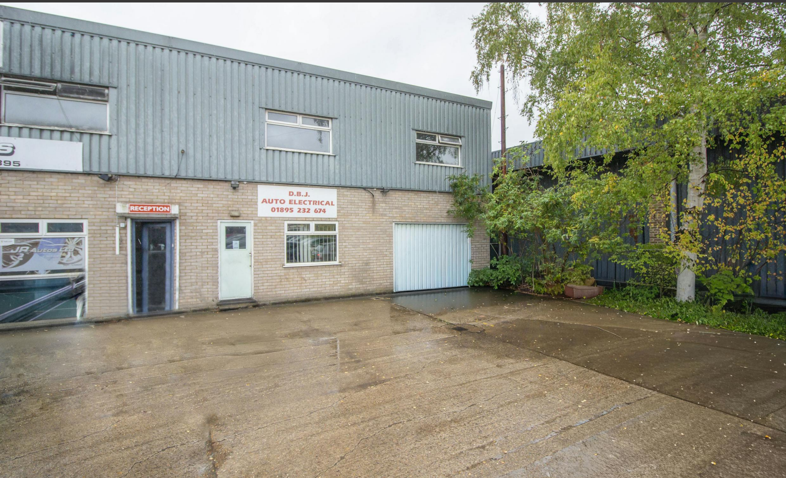
Unit 2a, Penfield Estate 17 Lancaster Road, Uxbridge, UB8 1AP