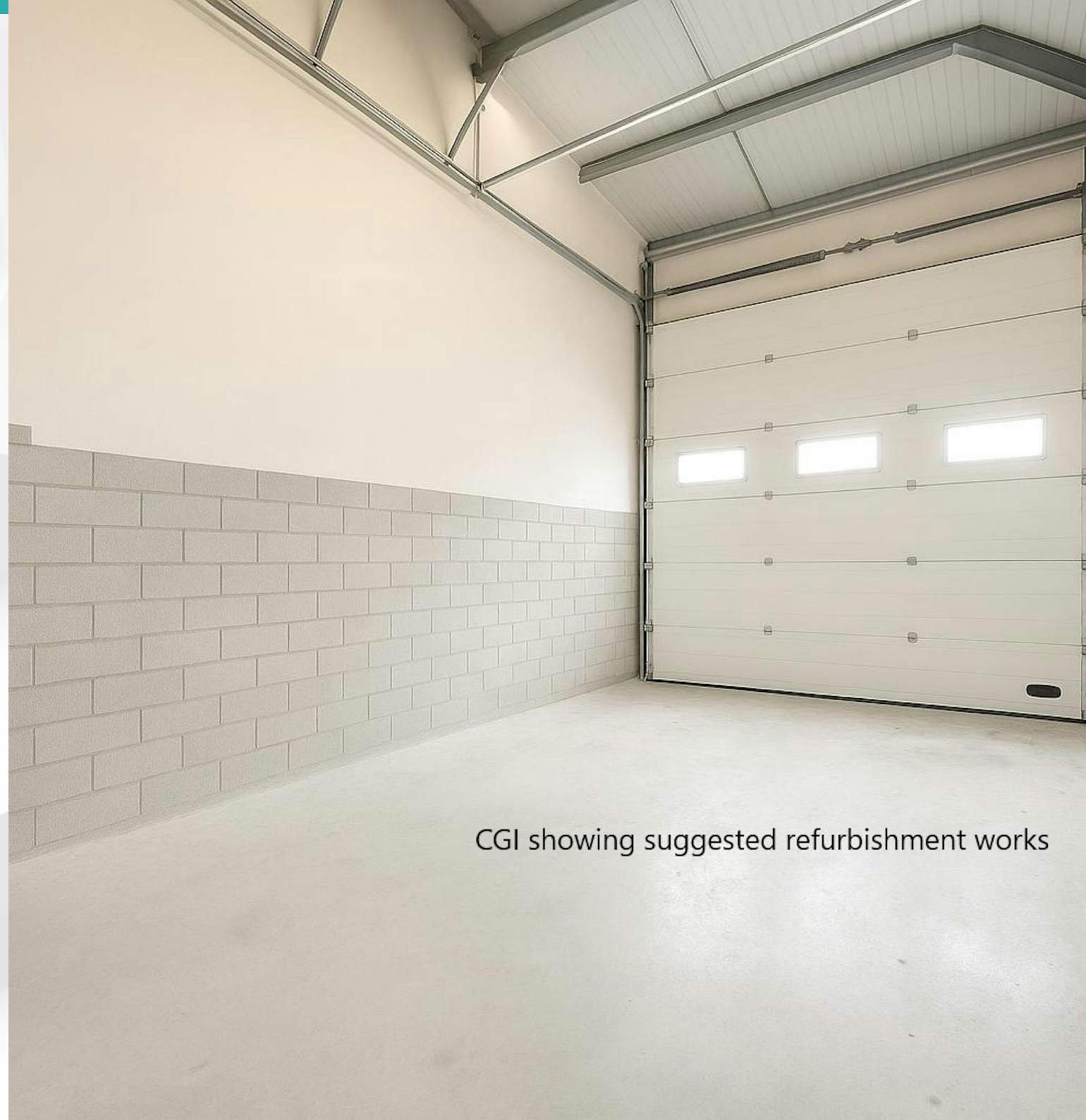
CGI showing suggested refurbishment works