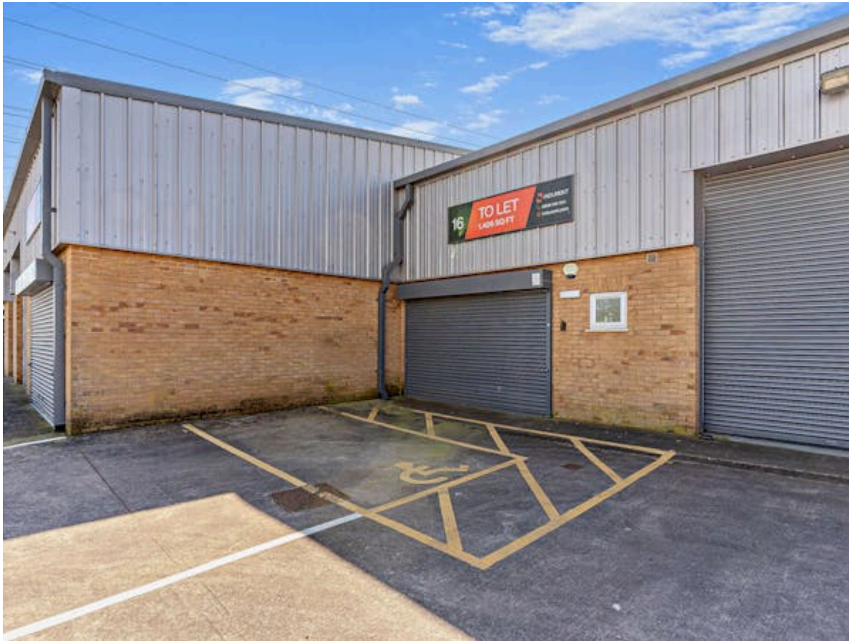
Unit 16, Estuary Court, Newport, NP19 4SX