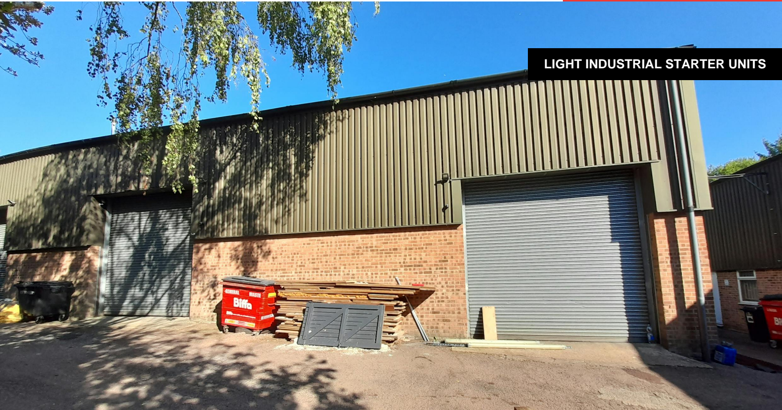
LIGHT INDUSTRIAL STARTER UNITS