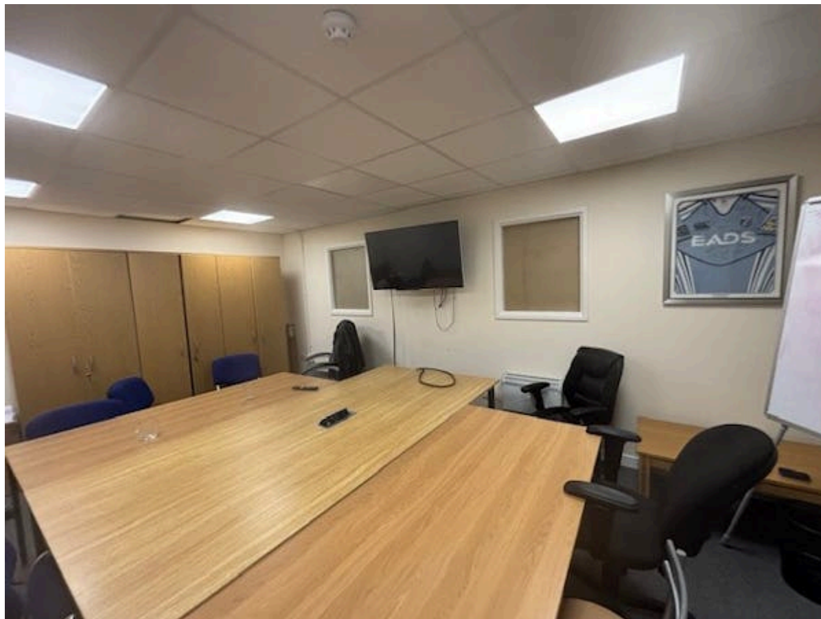
Unit 4, Avondale Industrial Estate, Cwmbran, NP44 1UG