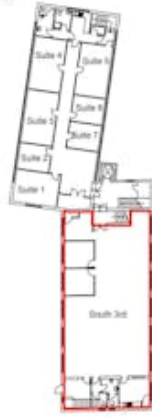
Warehouse Third Floor