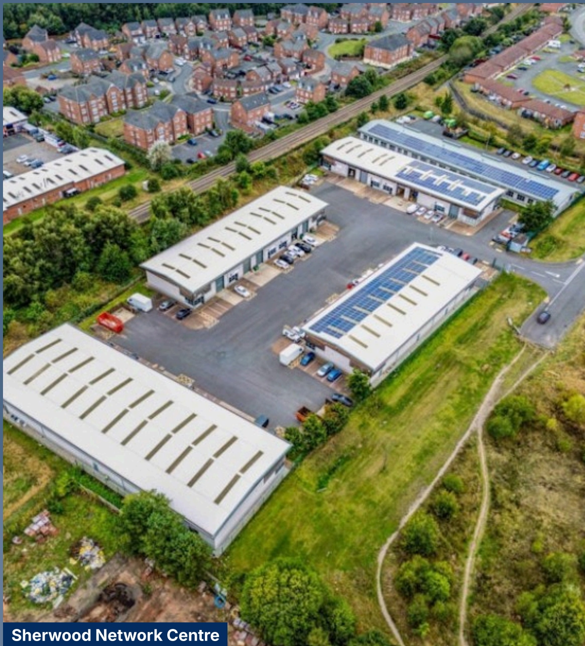
Sherwood Network Centre

Newark-on-Trent lies approximately 14 miles to the east, Mansfield approximately 9 miles to the west and Nottingham city centre approximately 20 miles to the south.