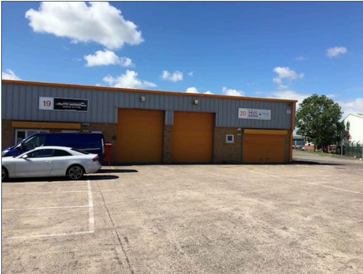
Unit 19, Estuary Court, Newport, NP19 4SX