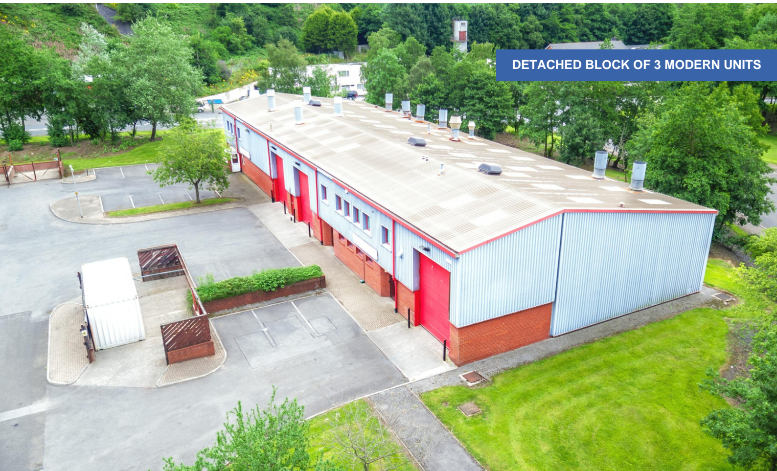
DETACHED BLOCK OF 3 MODERN UNITS