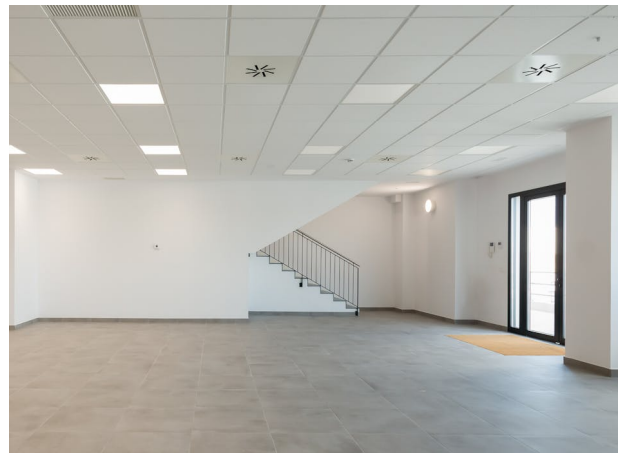
Panattoni Park Lisbon-City, N10, Santa Iria da Azóia, 2695-718