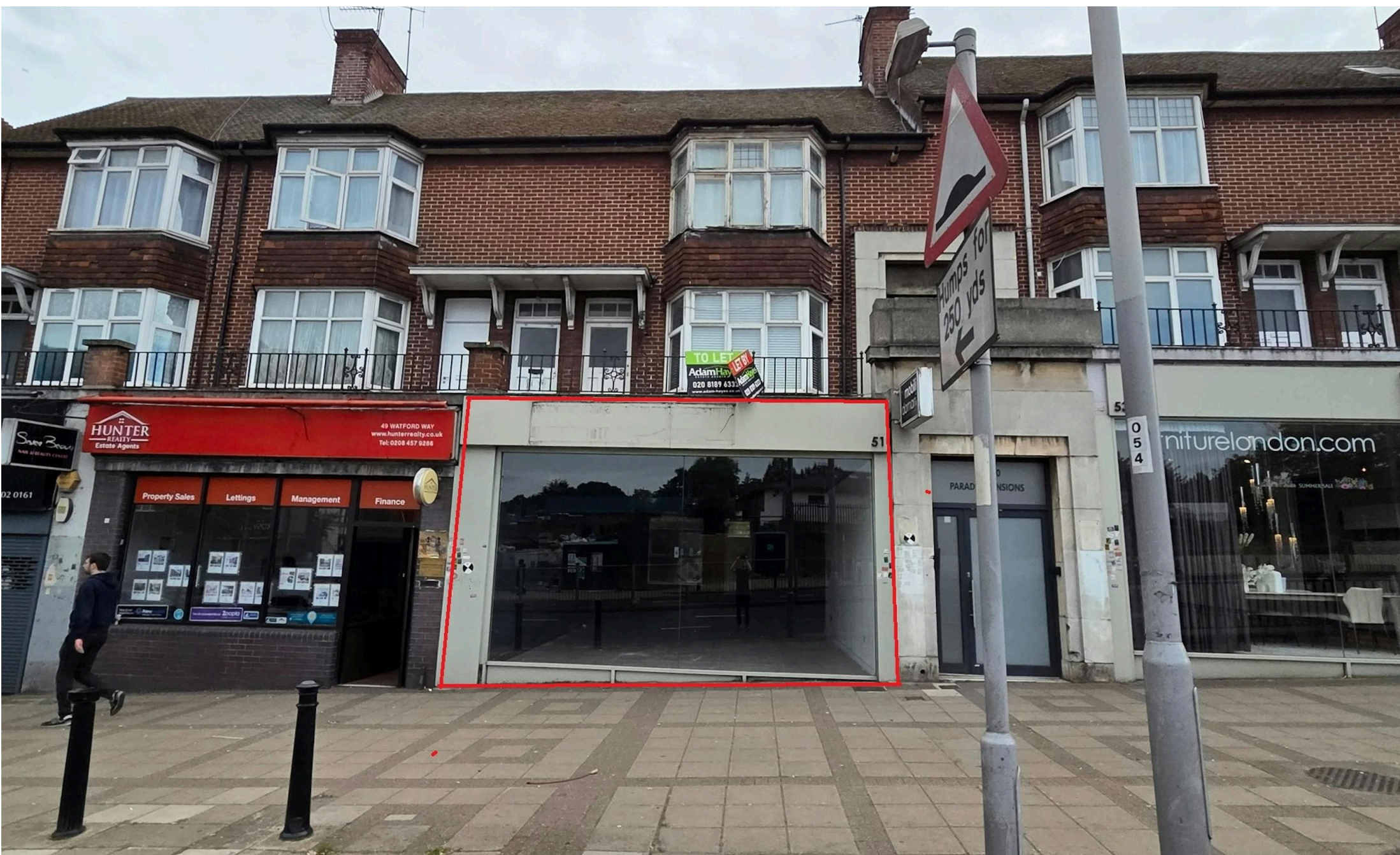
51 Watford Way, London, NW43JH Retail To Let | £25,000 per annum | 1,000 sq ft Retail Unit TO LET