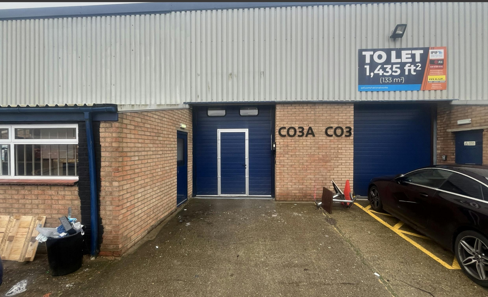
Unit C03A, National Works Trading Estate Bath Road, Hounslow, TW4 7EA