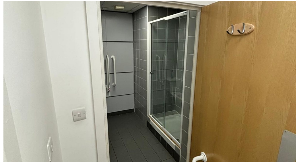
WhatsApp Image 20250915 at 134711_8a7969de.jpg