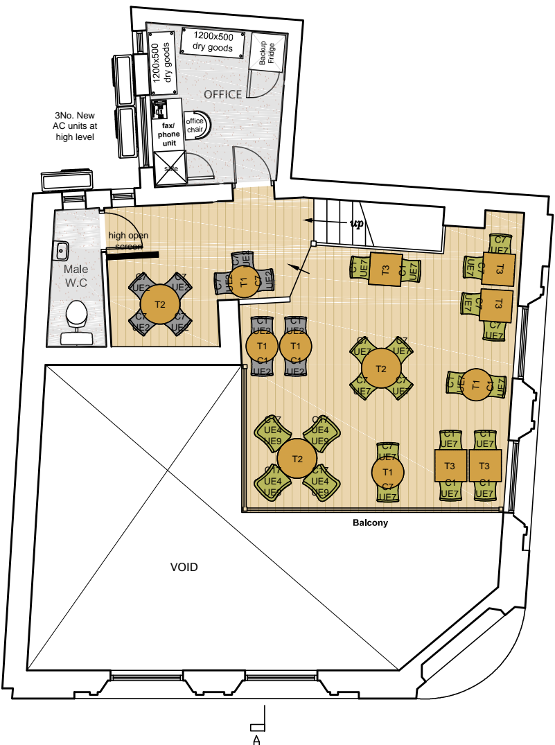
PROPOSED MEZZANINE PLAN 33 No. Covers 13 No. Tables