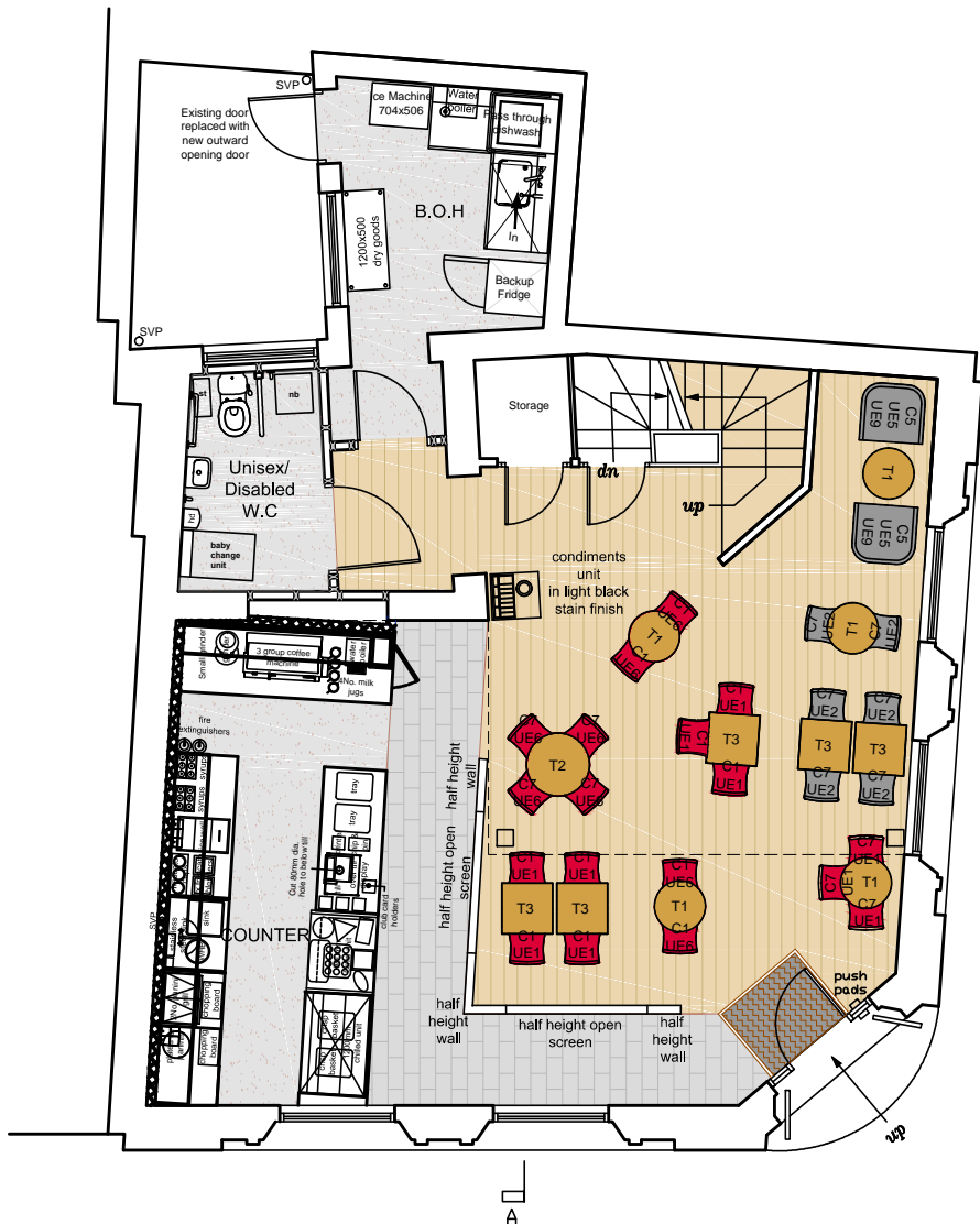
PROPOSED GROUND FLOOR PLAN 26 No. Covers 11 No. Tables