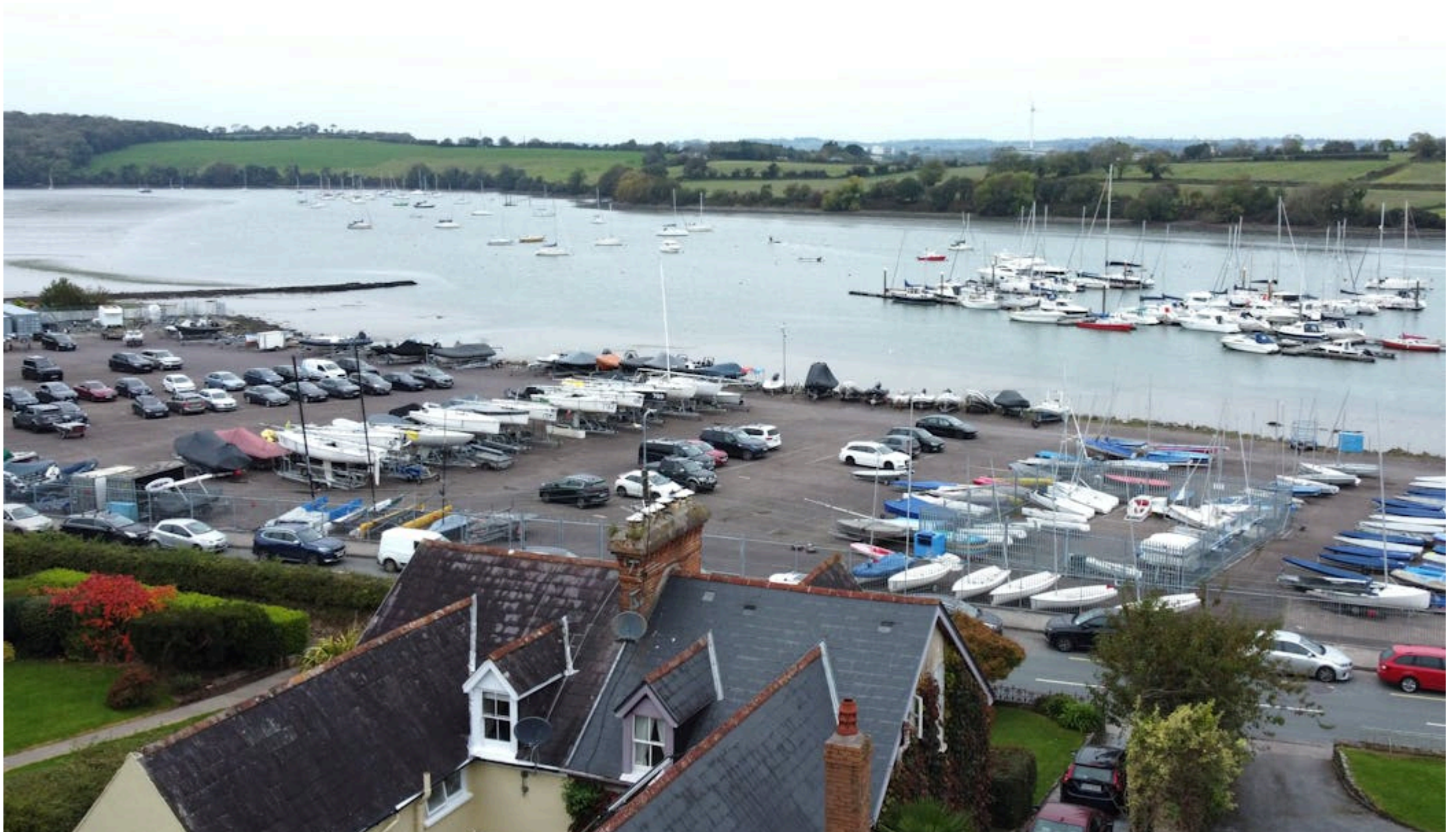
C.0.65 Hectare Site with FPP for 11 Houses, Lower Road, Crosshaven, P43 PK19