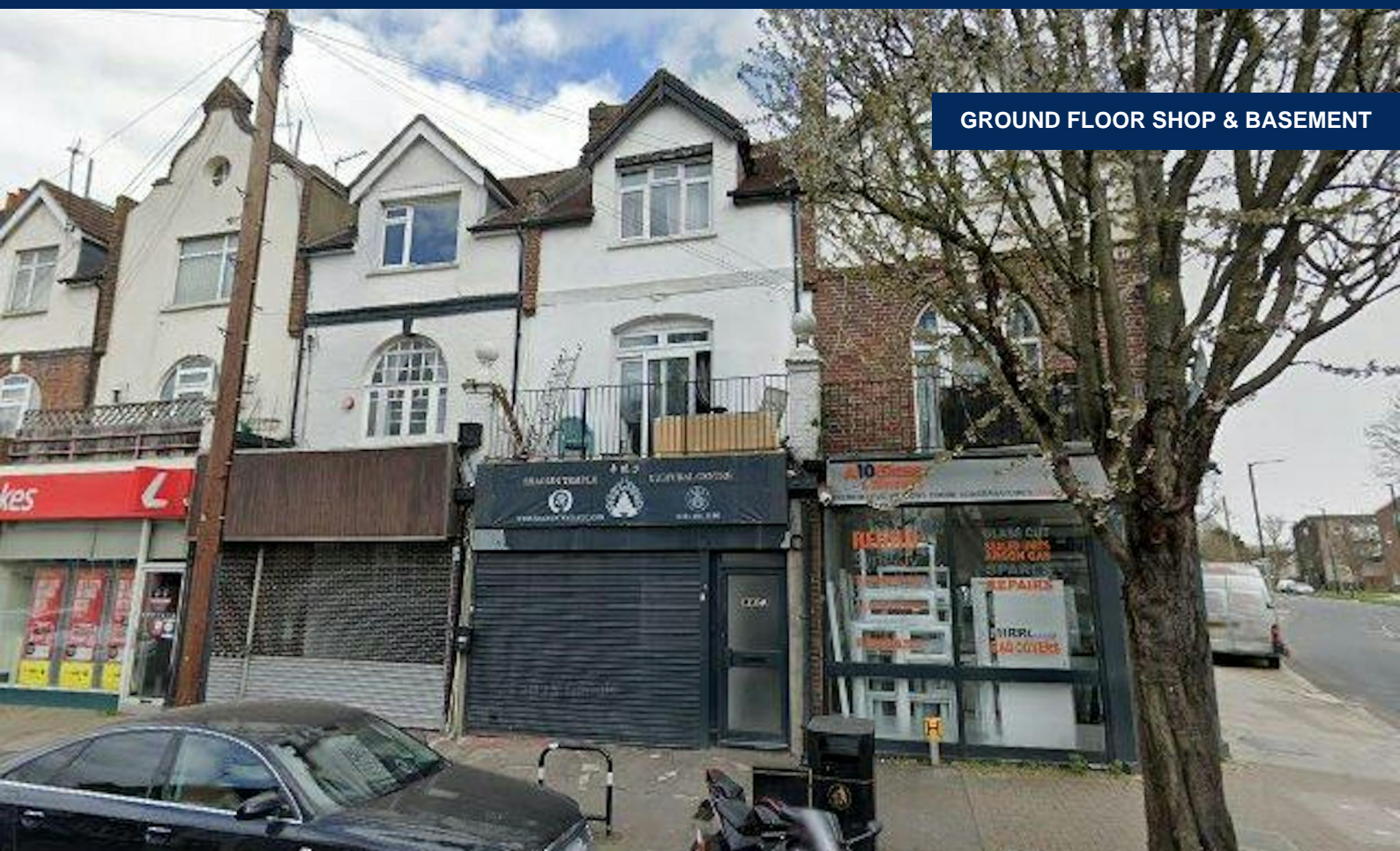
GROUND FLOOR SHOP & BASEMENT