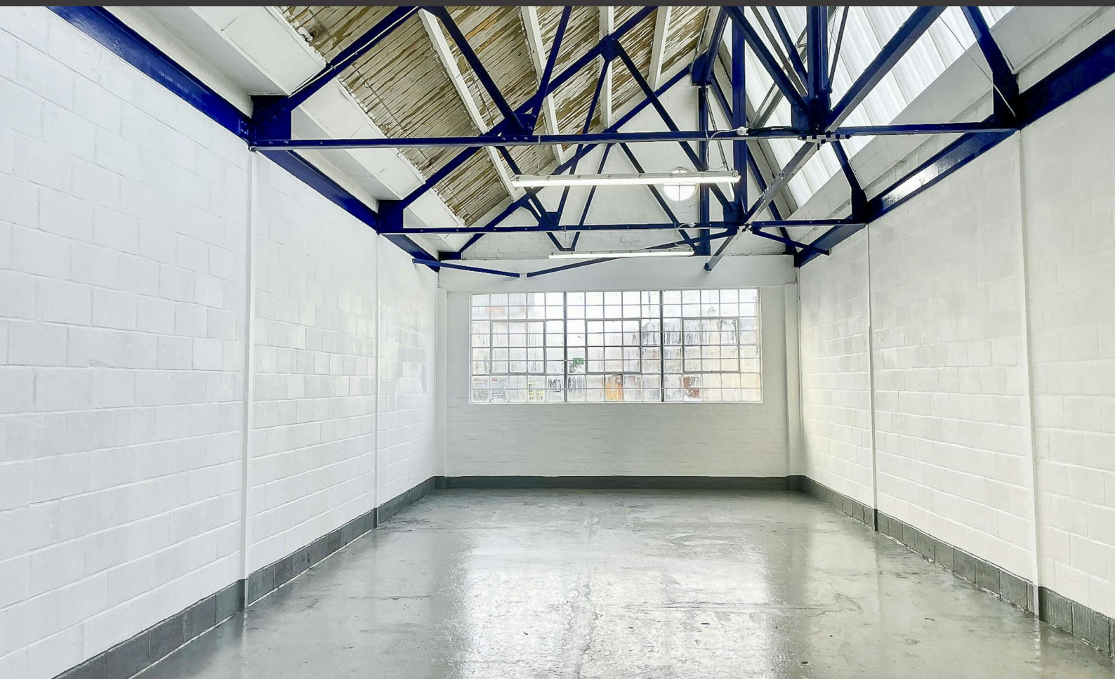
Unit G8, Atlas Business Centre Oxgate Lane, Staples Corner, NW2 7HJ