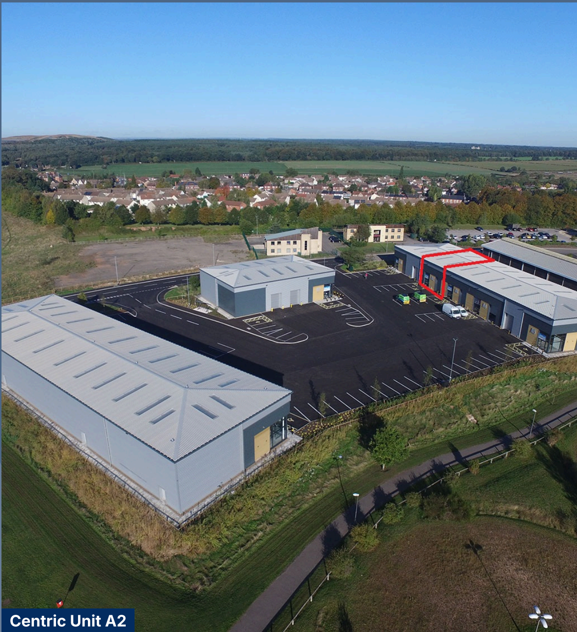
Centric Unit A2

The development provides convenient access to the A614 which leads north to the A1 and south to Nottingham City Centre. Nearby occupiers include the Centre Parcs HQ, Screwfix, and Tesco