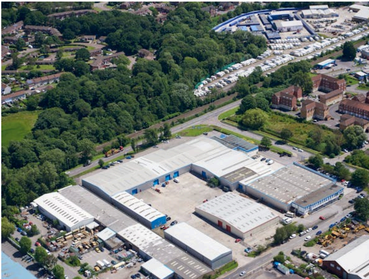
Unit 12, Avondale Industrial Estate, Cwmbran, NP44 1UD